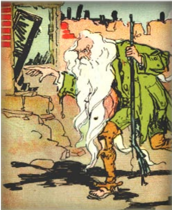
From the story Rip Van Winkle , picture 12.

thickets : a dense growth of shrubs or weeds